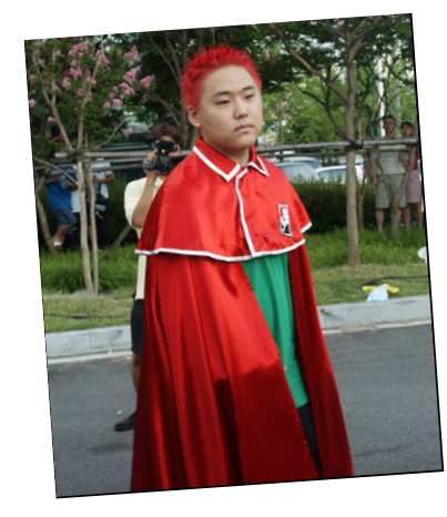
1st - 2004 Gillette OnGameNet Starleague