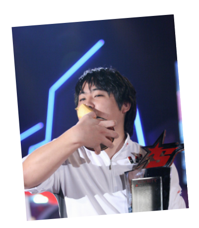
1st - 2008 EVER OnGameNet Starleague

their eggs and headed for the protoss main. They swooped in on Reach's only cannon, destroying it with ease. With no other air defence available, Reach ended his feeble resistance and typed gg.