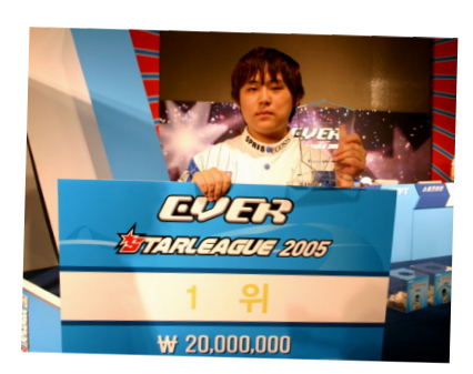
1st - 2005 EVER OnGameNet StarLeague